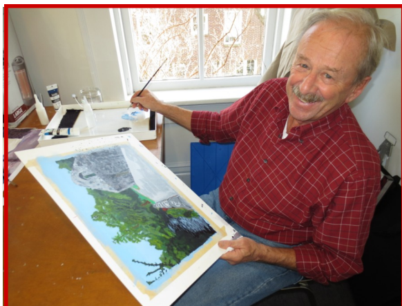
The MACK provides educational programs for all ages

Non-Profit Org. U.S. Postage PAID McCormick, SC 29835 Permit No. 7