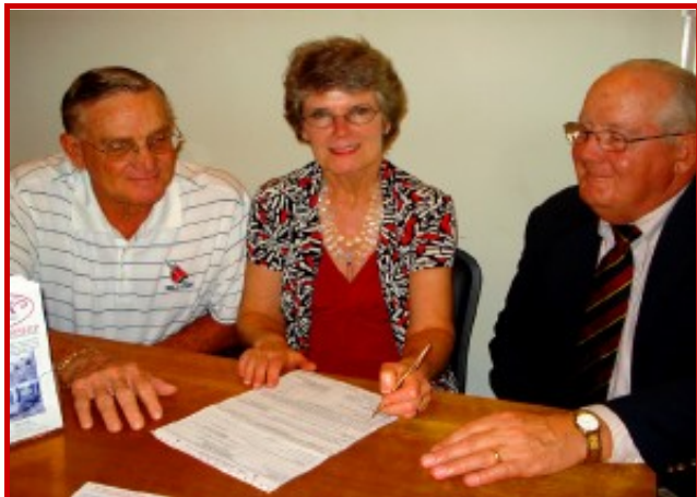
Consult your financial advisor