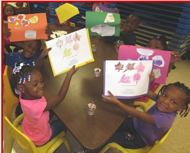
Education through the arts! Fun while learning!